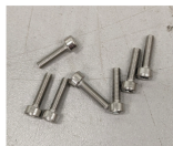
Figure 1: YIS CHC M3X12 DNOX A4

Command card for 8 dual color OBSTA projectors