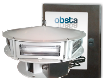
EP 1966535B1 & US 7816843