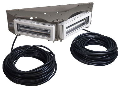
EP3230651, FR1462349, Pat. 10,247,386

This OBSTAFLASH120 ou 180 dual color medium intensity type A and B (or C) is designed for day and night marking of obstacle such as chimneys, pylons and high rise buildings (3 or more lights are required per level depending on diameter of the obstacle)