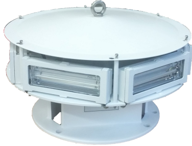
EP 1966535B1 &amp; US 7816843