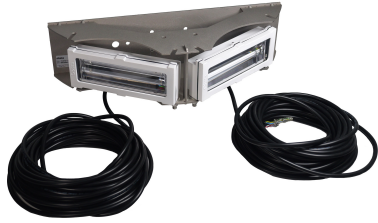
EP3230651, FR1462349, Pat. 10,247,386

The red medium intensity type B or C flashhead OBSTAFLASH120 is designed for night marking of obstacle such as stacks, intermediate pylons with 3 legs, facade of high rise buildings. A system that includes 3 red OBSTAFLASH120 120° around the obstacle and an OBSTA power cabinet complies with ICAO red medium intensity type B (or type C, CAA) and FAA L-864.