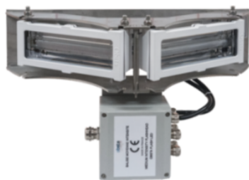
EP3230651, FR1462349, Pat. 10,247,386

This OBSTAFLASH120 ou 180 dual color medium intensity type A and B (or C) is designed for day and night marking of obstacle such as chimneys, pylons and high rise buildings (3 or more lights are required per level depending on diameter of the obstacle)