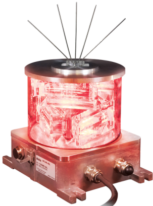
Patents: EP 1966535B1 & US 7816843