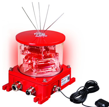
Patents: EP 1966535B1 & US 7816843