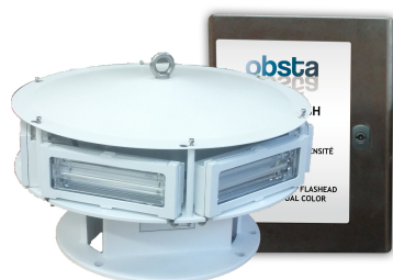
EP 1966535B1 & US 7816843