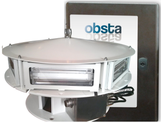
EP 1966535B1 & US 7816843