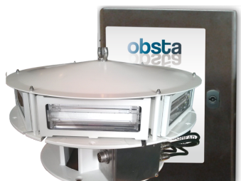
EP 1966535B1 & US 7816843