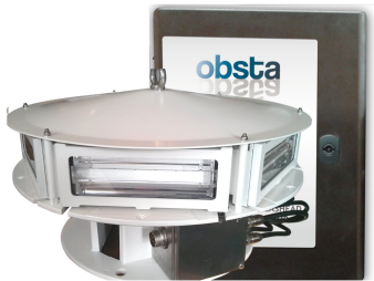
EP 1966535B1 & US 7816843