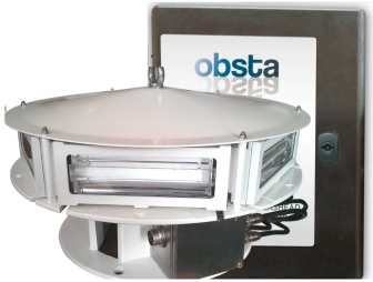
EP 1966535B1 & US 7816843