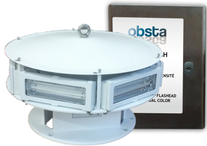
1966535B1 & US 7816843