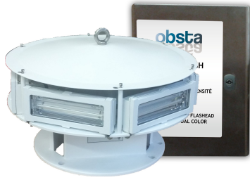
EP 1966535B1 & US 7816843