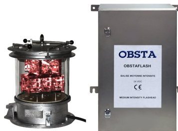
Patents: EP 1966535B1 & US 7816843