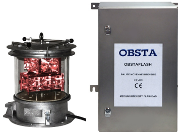
Patents: EP 1966535B1 & US 7816843

Xenon medium intensity type B compliant with ICAO medium intensity type B and compliant with FAA AC 150/5345-43G including a flashhead and a power supply (300m max)