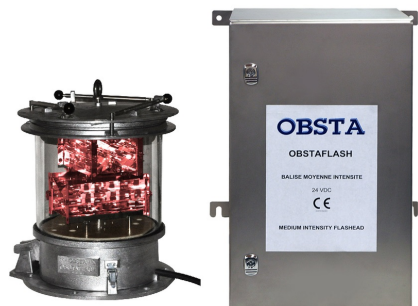
EP 1966535B1 & US 7816843