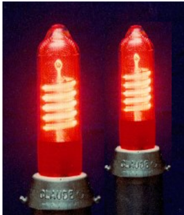
OBSTA lamp 5 turns with CLAUDE base Long life, red fixed lamp