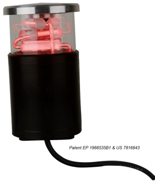
Patent EP 1966535B1 & US 7816843

Cold neon discharge low intensity type A devoted to the night marking of all kind of obstacles supplied by a standalone DC power source in 12VDC